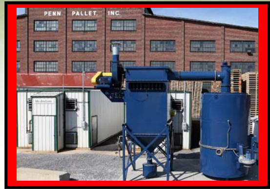
Heat treater and wood fiber burning biomass furnace by Abbott Control.

During the early years of repairing pallets a major cost was the disposal of the broken wood components into the landfill. What do you do with all the wood waste? It took several years before the company could invest in equipment to grind the wood waste into a product that could be used for other industries. In 2004 when Penn Pallet opened its repair facility in Woodland, PA, the building was equipped with grinding equipment and a furnace that used the ground wood waste as fuel to heat the building. That project was a success by eliminating the need for the fuel oil furnace used to heat the manufacturing area in the winter months.