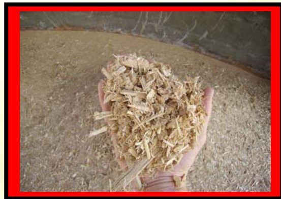
Wood fiber ground from pallets and particleboard.